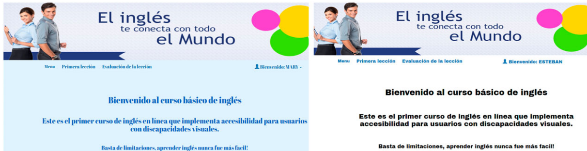
FIGURE 5 Main interface on the online course with and without adaptation for blurred vision users

NoCoffee showed that the web application is accessible for users with blurry vision up to grade 3. Similarly, NoCoffee showed that the web application is accessible for users with the eight types of dichromatic color vision that the tool simulates, ie, protanopia, protanomaly, deuteranopia, deuteranomaly, tritanopia, tritanomaly, achromatopsya, and achromatomaly. The Vision and Hearing Impairment Simulator is a tool that applies simulated vision impairment to images or software. Tests performed with this simulator showed that the online course is accessible for users with blurred vision due to cataracts of 80% severity. Spectrum is an extension for Chrome navigator to test web pages for users with different types of color vision deficiencies. The test performed showed the same results as the test performed using NoCoffee. WAVE is an extension of Chrome navigator that presents the evaluated web page with embedded icons and indicators that visually present information about the accessibility. The results obtained were zero errors and zero alerts. AChecker is an open tool used to evaluate web pages for accessibility issues and identifies three types of problems: know, likely, and potential. The results of the tests executed indicated zero known problems, zero likely problems, and 31 potential problems. As an example, Figure 6 shows the results of the accessibility evaluation with WAVE and the simulation with NoCoffee.