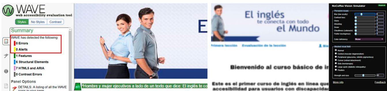
FIGURE 6 Accessibility evaluation results with WAVE and simulation with NoCoffee