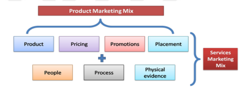
Figure 2: Service Marketing Mix Elements

The Service Marketing Mix involves Product, Price, Place, Promotion, People, Process and Physical Evidence (Tek, 1990: 43-45). Firms marketing a service need to get each of these elements correct.