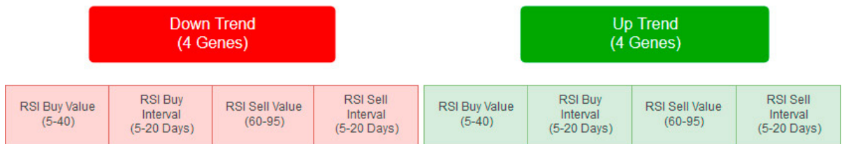
Fig. 2. Chromosome with 8 genes