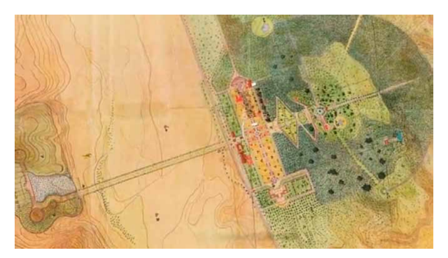
Fig. 2. The plan of Egli for Forest Farm (AOÇ Araştırmaları 2014)

In the following years of the construction period of Ankara, the territory of the Farm has become to decrease