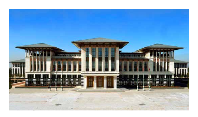
Fig. 4. White Palace of post-2000s period, by Birkiye (Arkitera 2015)

The architectural language of the Palace is consisted of wide roof trees, column series, and Ottoman and Seljukian adornments in order to compose the Revivalist approach. The building has a symmetrical and axial mass design. Each façade of the Palace displays its rules of composition with columns, windows and doors. In order to emphasize the vertical elements of the composition, double and triple column groups are used in the facade. The rates and proportions of the space and mass also contribute to the strict symmetric design of the building. The monolithic structure of the block is divided by the multiple ceiling covers.