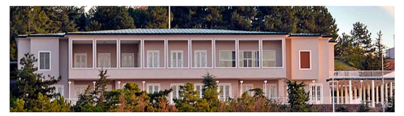
Fig. 1. Cankaya Palace of Kemalist period by Holzmeister (Presidency of Turkish Republic 2015)

claim that, Holzmeister used "modern monumentality in representing state authority with hidden layers of classism" (2012: 84).