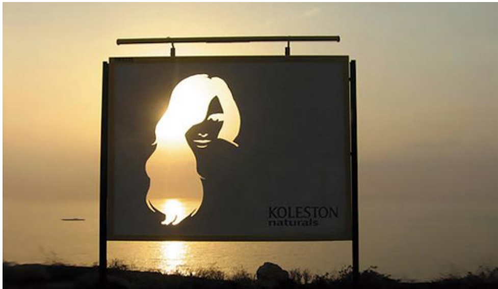
Figure 11: Koleston's Guerrilla Advertising Example