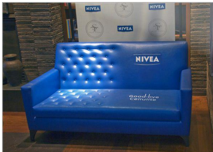
Figure 4: Nivea’s Guerrilla Advertising Example

Lastly, the guerilla advertising example that women liked was the advertisement of “Nivea” with 10.2%.