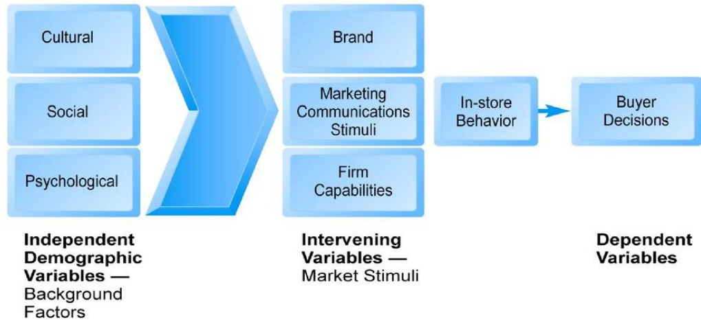
Table 3: General Consumer Behavior Model

Based on: Kotler and Armstrong, Pearson Education (2014), Inc. Publishing as Prentice Hall Slide 6-7