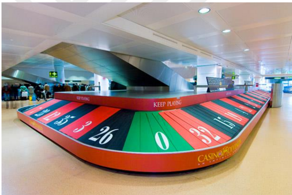
Figure 12: Casino de Venezia's Guerrilla Advertising Example