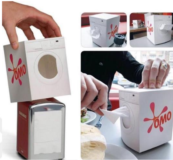
Figure 5: Omo's Guerrilla Advertising Example