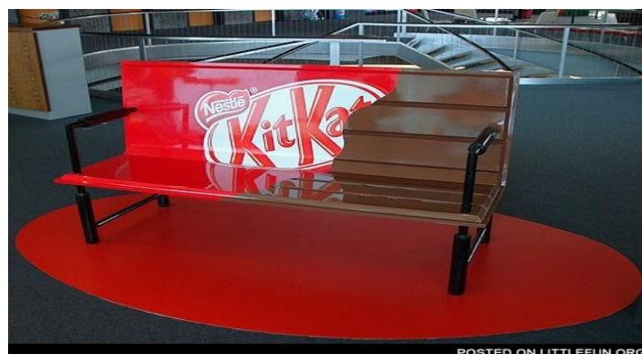
Figure 2: Nestle, Kitkat’s Guerrilla Advertising Example

In line with the results, the primary guerilla advertising example that women liked was the advertisement of “Nestle, Kitkat” with 8%.