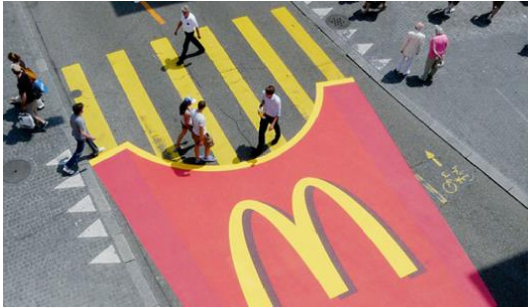
Figure 9: Mc Donalds's Guerrilla Advertising Example