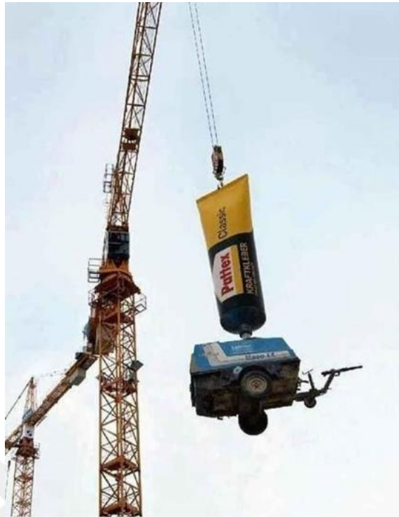
Figure 7: Pattex's Guerrilla Advertising Example