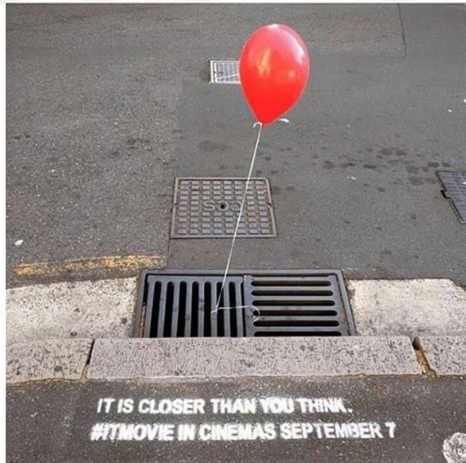
Figure 8: IT Movie's Guerrilla Advertising Example