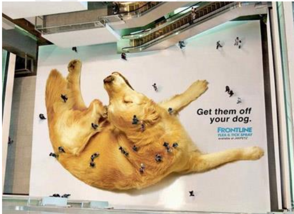
Figure 10: Frontline's Guerrilla Advertising Example