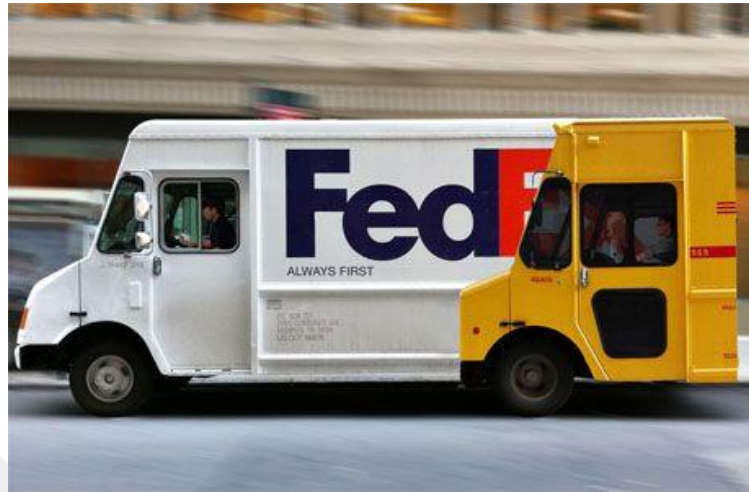
Figure 3: FedEx’s Guerrilla Advertising Example

In the second place, the guerilla advertising example that female consumers liked was the advertisement of “FedEx” with 6.6%