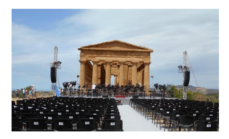
Figure 3.8. Sicily Symphony Orchestra Arrangements on the site