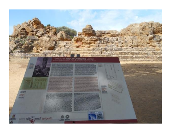
Figure 3.5. Informative Signboards on the Site

It is important for visitors to gain an understanding and importance of heritage. Without reading or searching may not be sufficient to have all this information from the signboards. Informative signboards of archaeological finds and anastylosis have 2D, 3D, section and detail drawings of the find and brief information in Italian, English, and French (Figure 3.5).