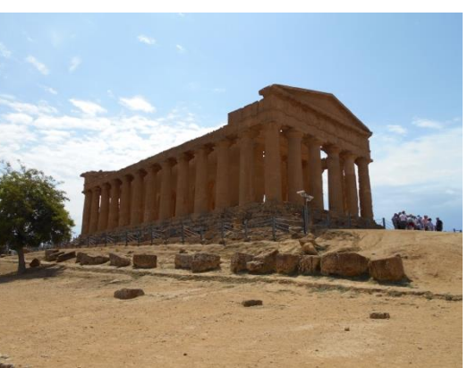
Figure 3.3. The Temples on the Site

Agrigento's population was 58.956 in 2018 [33]. It attracts people with the temples structured in the valley. Cronaca (2020) posted about the increase of the number of tourists visiting the Valley of the Temples; it is recorded that 956,578 visitors accessed the site by December 2019 which is 7000 people far more than 2018 [34]. In addition to the number of visitors, the observation of visitor profile is essential when managing visitor management. It could be much more efficient to seek visitor profiles and highlight particular issues. Ticket sale data is a way to achieve the general profile.