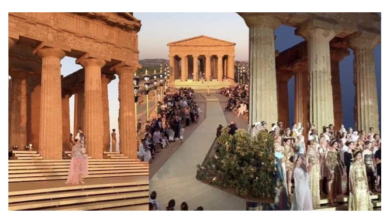
Figure 3.9. Camp Dinner, Re-enactment of the Triumph of Esseneto and Dolce Gabbana Fashion Show in the archaeological site of Agrigento [36, 37, 38].

Presentation and interpretation of archaeological sites are anticipated as one of the primary subjects of site management [17]. Archaeological finds are meaningful to the visitors when the anastylosis technique is used. However, it is impossible for most of the sites. So basic information and 3D Models are informative when presented on the site signboards and museums. Pietro Griffo Archaeological Museum is located around the Saint Nicholas Church finds and exhibits archaeological artifacts of Valley of the Temples. Visiting costs 8 € for the museum and 13 € museum and the valley. Finds and historical documents are displayed in the museum for visitors (Figure 3.10). Limited parts are suitable for disabled access however there are no additional arrangements for visual or hear impairment (Figure 3.11). UNESCO advises that in terms of having a limited source of heritage it is better to apply low-tech and cost solutions. Application of restriction of access to sensitive areas on the site, more expensive ticketing system for particular areas,