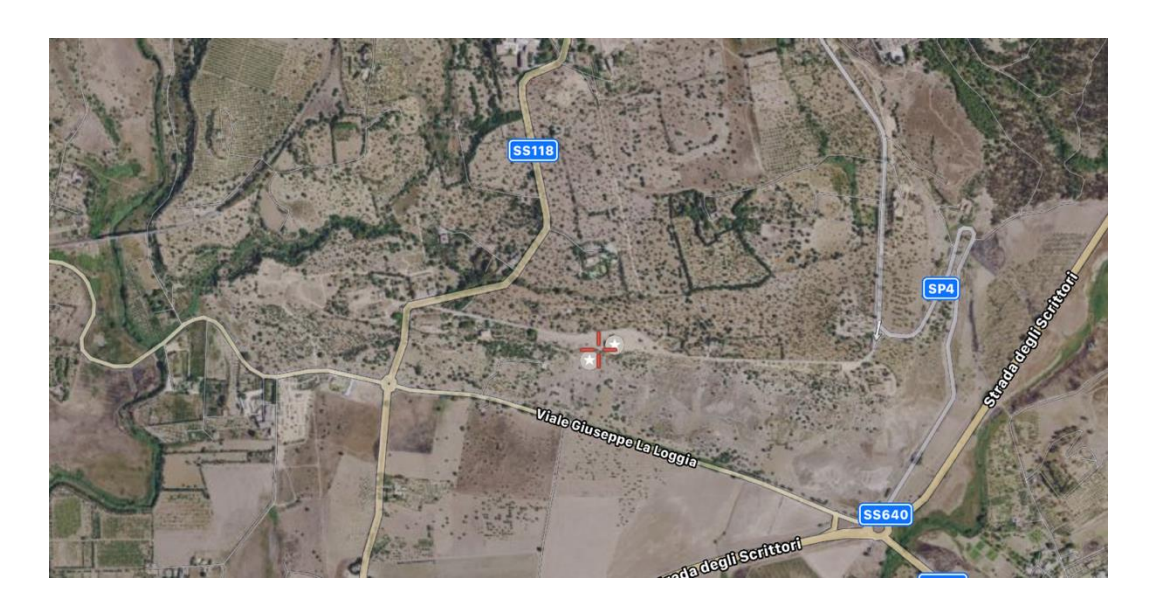
Figure 3.2. Agrigento Map [31].