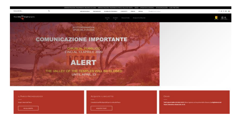
Figure 3.7. The Valley of the Temples Archaeological Park Official Website [32].

Su et al. (2020) state that tourists travel heritage sites to gain emotional, recreational, and educational or cultural experiences [22]. Before visiting a heritage site, people research and get perception from media, books, tv or the internet. This image concluded as a positive or negative experience after visiting. Considering online facilities, the site has an official website that gives updated information about the closing days, events, archaeological artifacts, landscape, tickets (Figure 3.7). There are also Twitter and Instagram accounts visitors could be informed however are not updated.