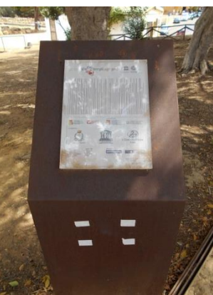
Figure 3.4. Wheelchair use and Braille Tactile Map on the site

It is important for visitors to gain an understanding and importance of heritage. Without reading or searching may not be sufficient to have all this information from the signboards. Informative signboards of archaeological finds and anastylosis have 2D, 3D, section and detail drawings of the find and brief information in Italian, English, and French (Figure 3.5).