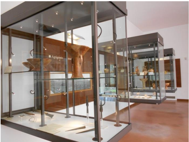
Figure 3.10. Pietro Griffo Archaeological Museum