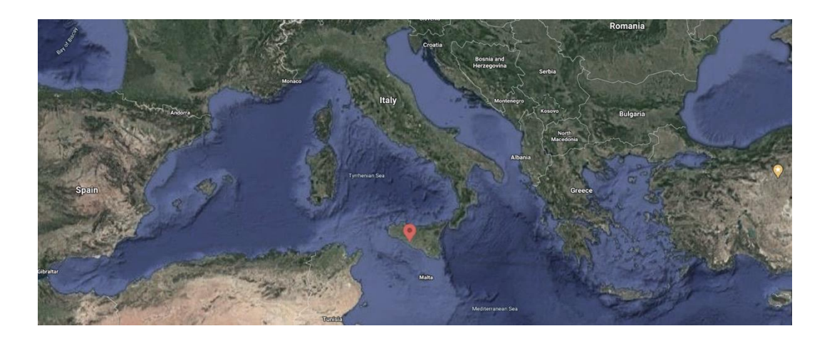
Figure 3.1. City of Agrigento Location [29].

The site covers 934 ha land in the area (Figure 3.2). It is located 4 miles away from Agrigento city center; it is possible to cycle, walk or use public transportation. The site is placed between the zone between Akragas and Hypsas rivers. The site is subjugated under 20/2000 legislation named as "The Establishment of Valley of the Temples and Archaeological and Landscape Park". With this legislation, the site is divided into three areas as;