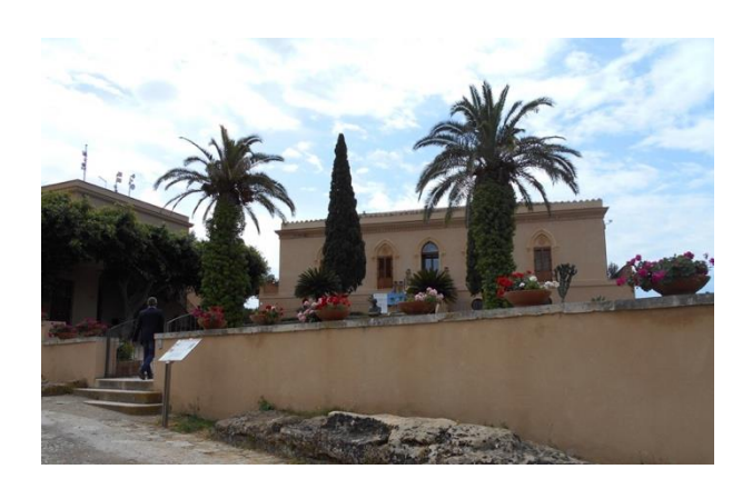
Figure 3.6. Villa Aurelia

Article 2/5 of the regional law of 20/2000 says the existing buildings could be transformed into accommodation and service buildings for social, recreational, cultural and tourist purposes however volume and height of the provisions should be regarded [30]. Villa Aurelia which was constructed as a house of Sir Alexander Hardcastle -made archaeological works on the site for twelve years- is now served as the park's main building and open to the temporary exhibitions (Figure 3.6) [32].