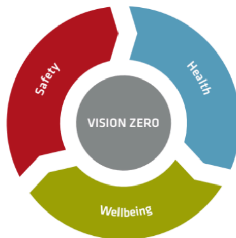
Figure 1. The VZ approach [7]

Using seven golden standards, VZ is gaining popularity as a long-term commitment plan to accomplish ZA and ZH in the workplace (Table 1). In most companies, safety comes first, with employee health and wellbeing receiving significantly less attention. VZ should be considered as a holistic vision in which work-related health, safety, and wellbeing are addressed, and synergies across these areas are recognized and exploited. There is sufficient evidence to establish that tiredness, stress, and work organization factors are critical determinants of safety behavior and performance in general.